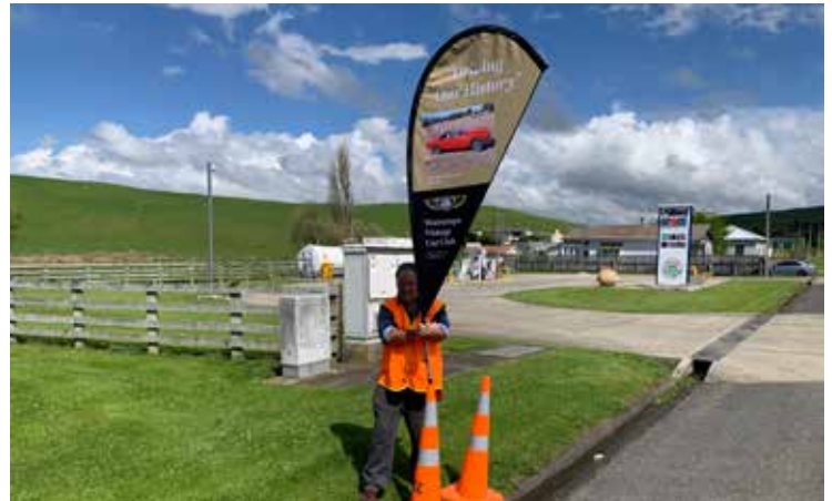
Hugh Hunter with new branch banner