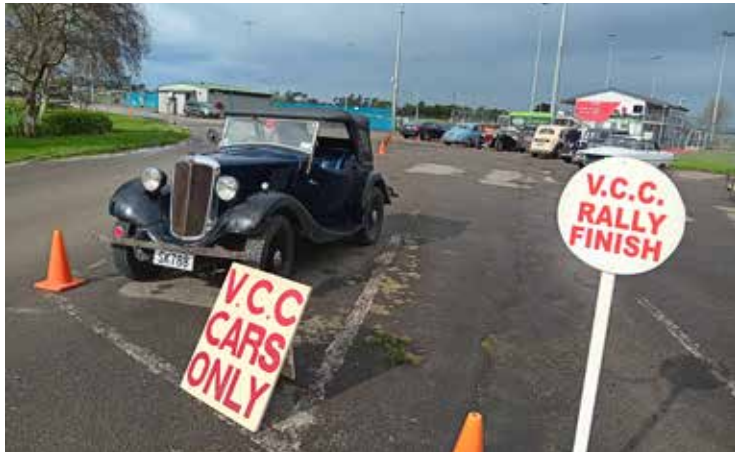
1935 Morris 8 Sports - Matt Hunter