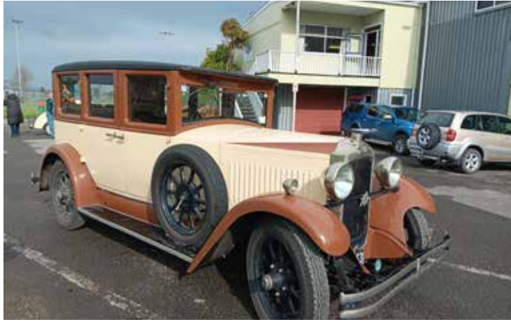
1929 Vauxhall - Neale Ryder