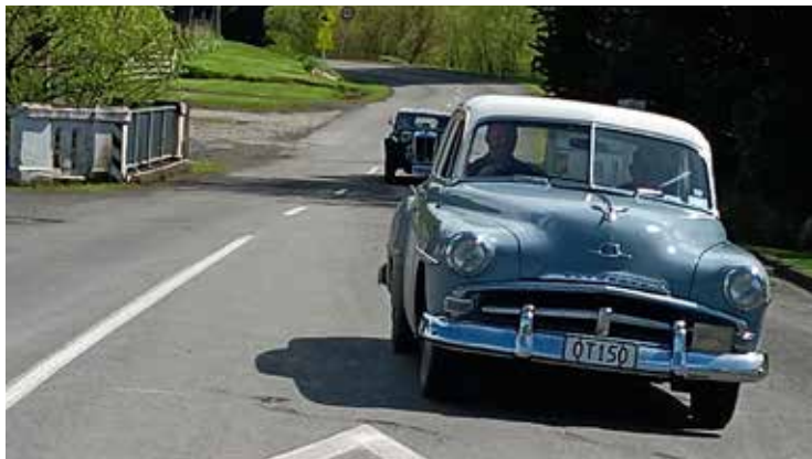
1951 Plymouth Cranbrook - Darryl Longstaffe